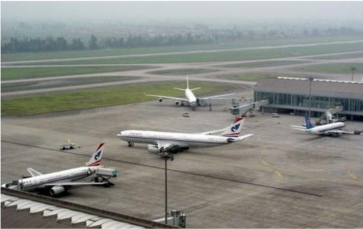
Chengdu airport dropping off, end the trip.